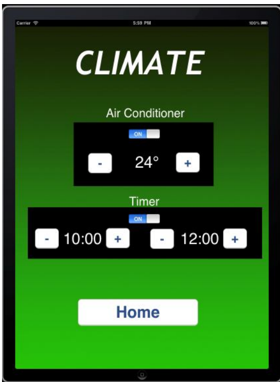
Fig. 3: Climate Management

Finally, Alarm Section (Fig. 5) allows you to set the anti-intrusion, anti-fire and anti-flooding alarms.