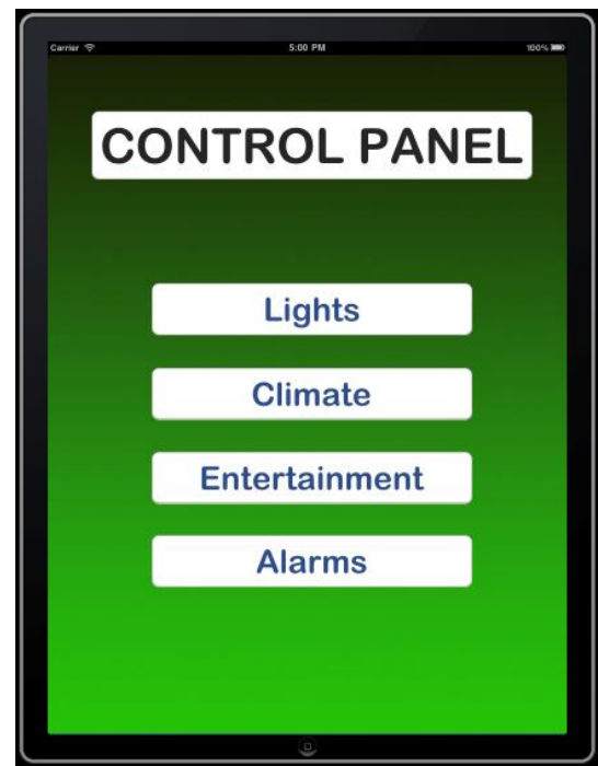
Fig. 1: Control Panel

The application has been implemented and organized using a View-Based Application that allows you to easily navigate between different Views of the application itself. Through the main panel you can manage different systems in each room of the house (Fig. 1).