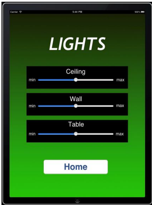
Fig. 2: Light Management

The Climate section (Fig. 3) allows you to control the air conditioning system, by switching on or off, by setting the temperature and an activation time slice.